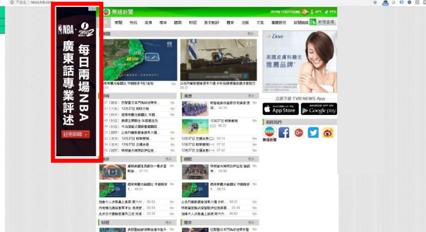
TVB news Web